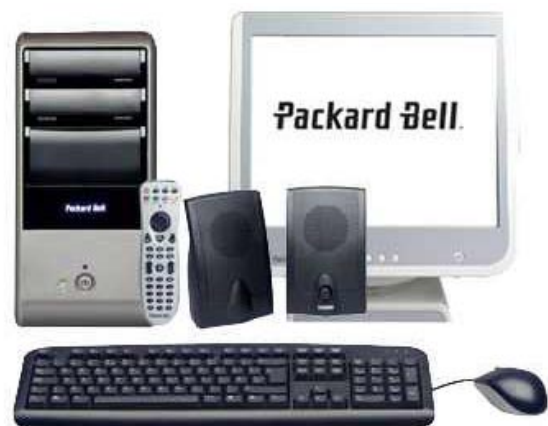
Packard Bell 1314 PC, £379