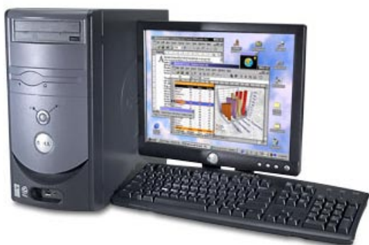
Dell Dimension 3000 PC, £329

Many different PCs are available, made by companies such as IBM, Dell, Mesh, Compaq, Packard Bell and Tiny. It is possible to get a basic PC for well under £500, while the latest “top of the range” computers can cost over £2,000.